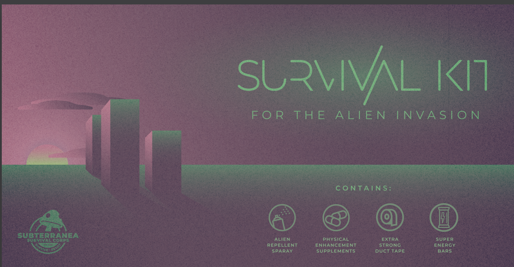
OUTER LABEL FOR THE KIT'S CONTAINER